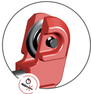
instant wheel change