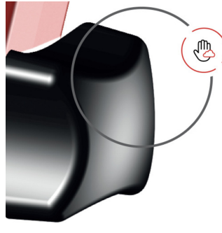
extra reduced radius spin