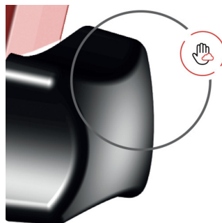
extra reduced radius spin