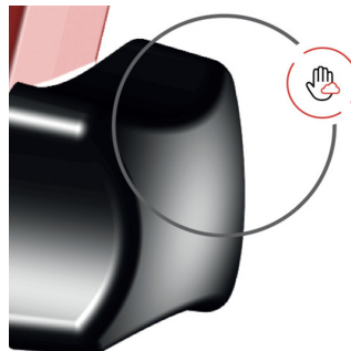
extra reduced radius spin