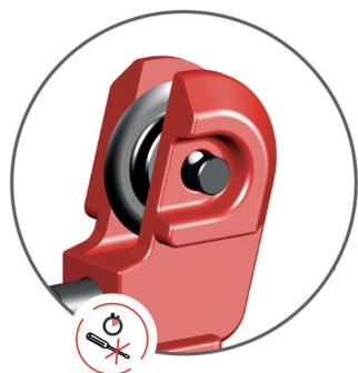
instant wheel change