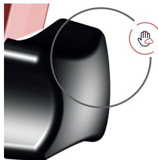
extra reduced radius spin