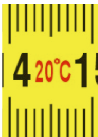
Working temperature condition