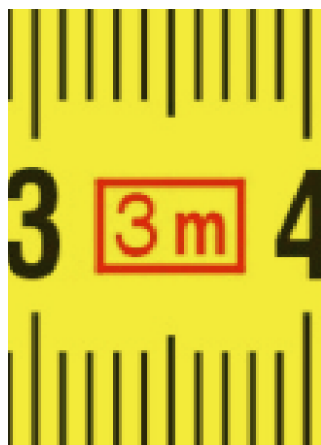
Length of tape