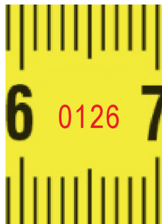
Notified body no.