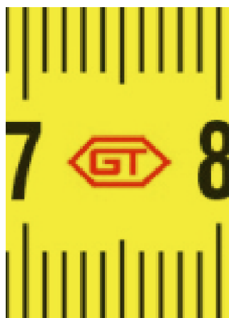
Abbreviations for manufacturer