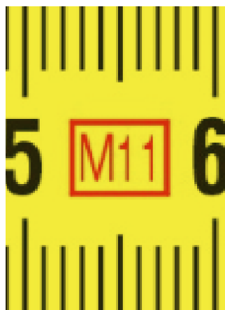
Year of manufacture