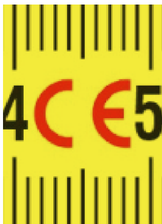
Manufactured in accordance with harmonised standards