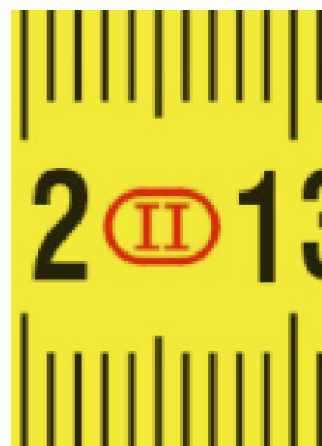
Preciseness to class II