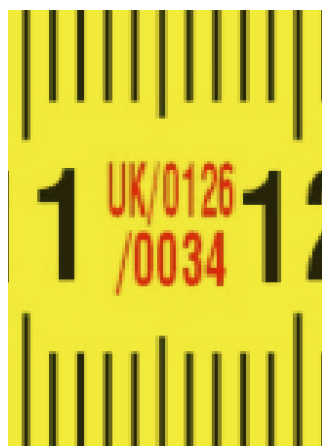
European type approval certificate