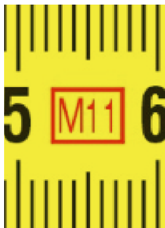
Year of manufacture