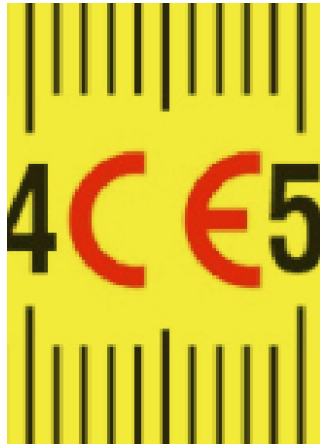
Manufactured in accordance with harmonised standards