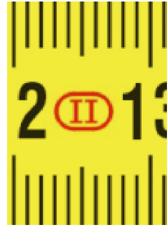
Preciseness to class II