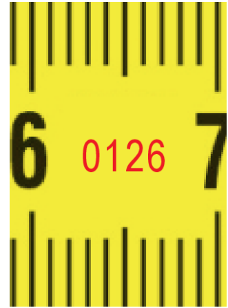
Notified body no.