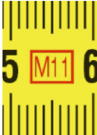
Year of manufacture