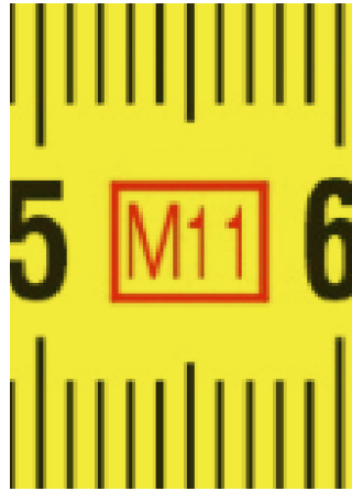
Year of manufacture