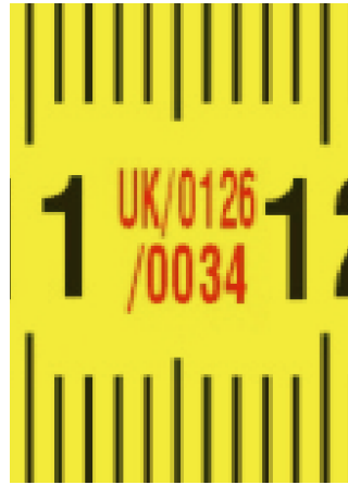
European type approval certificate