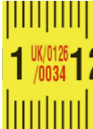
European type approval certificate