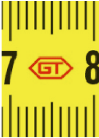
Abbreviations for manufacturer