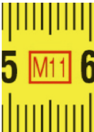
Year of manufacture