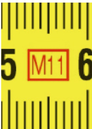
Year of manufacture