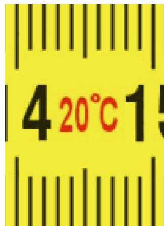
Working temperature condition