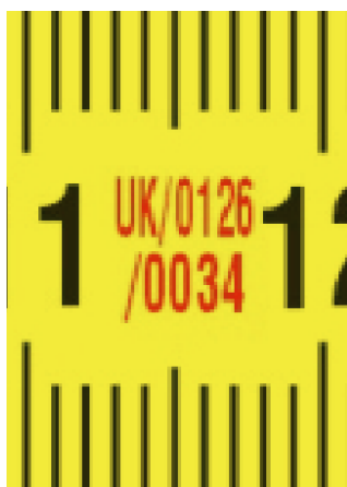
European type approval certificate