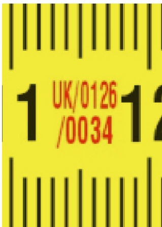
European type approval certificate