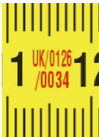
European type approval certificate