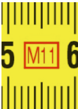
Year of manufacture