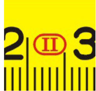
Preciseness to class II