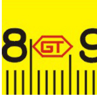
Abbreviations for manufacturer