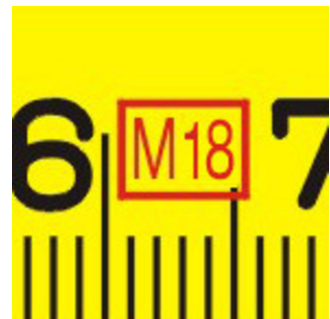
Year of manufacture