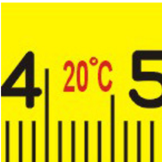
Working temperature condition