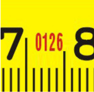
Notified body no.