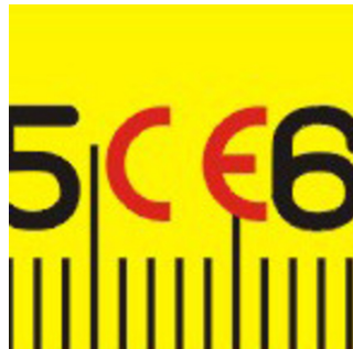
Manufactured in accordance with harmonised standards