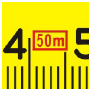
Length of tape