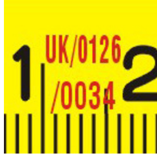
European type approval certificate