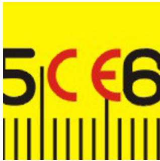
Manufactured in accordance with harmonised standards