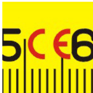
Manufactured in accordance with harmonised standards