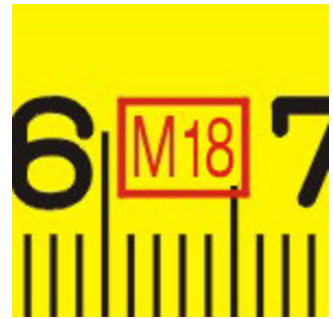
Year of manufacture