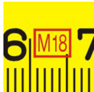
Year of manufacture